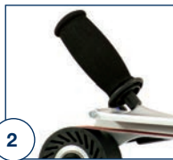
2 Additional handle for comfortable, overhead working.