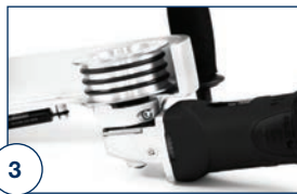
3 The drive roller with the rubber rings ensures that the grinding belts will not slip.