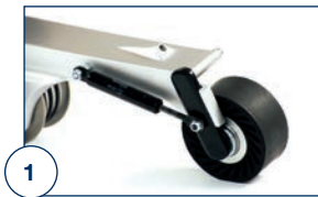
1 Gas pressure cylinder allows belt to conform to contour of pipe with proper pressure.

The new contour concept with the elastic return roller allows the grinding and polishing belts to conform around the external diameter of the pipes with light, uniform pressure.