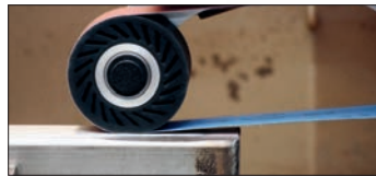
The soft grinding roller made of PUR material also allows comfortable longitudinal grinding of flat surfaces, for example to remove spot welds or eliminate deep scratches.